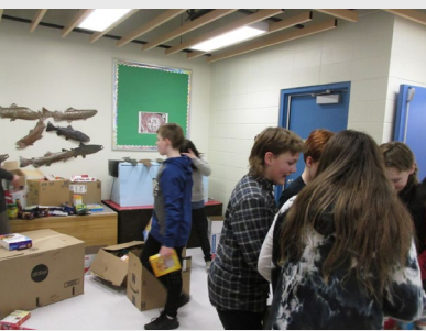
Leadership Group Students at Uplands Elementary School help sort and box up items collected by the school for donation to the Terrace Church's Food Bank and to the Salvation Army Food Bank.

Some of our Leadership Group students helped sort and box up items collected by the school for donation to the local food bank. This was an event that was organized and spearheaded through classrooms with our families. Together as a school, we collected well over 1,000 food items and more that $200 in donations to donate to the Terrace Church's Food Bank and to the Salvation Army Food Bank. This event connects well with our school's commitment to giving back to the community.