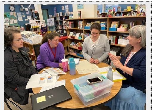
Teaching staff at Nechako Elementary School developed strategies on how best to approach student learning areas in need.

Administration and teaching staff assessed and reviewed the data from the fall student assessments in reading, writing, and math. The results of the review highlighted areas of focus and helped teaching staff plan a more targeted approach to student learning. Our biggest concern was the grade one reading results from the PM Benchmark Assessment. PM Benchmarks are used as an assessment tool to gauge children's reading levels. During a staff meeting teachers developed strategies on how best to approach student areas in need. The following teacher feedback was shared through the opportunity to meet and collaborate on student improvement areas: