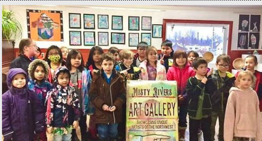
Primary students at New Hazelton Elementary School celebrated their newly acquired knowledge learned during Fine Arts lessons by displaying their art at the Misty Rivers Community Arts Council's Gallery for the months of November and December 2022.