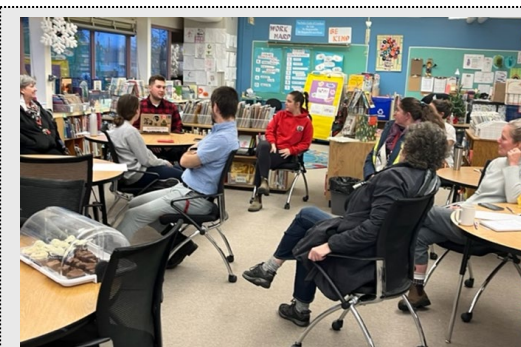
Nechako Elementary administration and teaching staff met during a School Staff Meeting to assess and review data from the fall student assessment which highlighted areas of focus and helped teaching staff plan a more targeted approach to students learning.

"Having the time to review our school assessments in a timely manner is helpful to monitor a student's progress in real-time, so any changes in performance can be tracked and addressed as they arise rather than in retrospect."