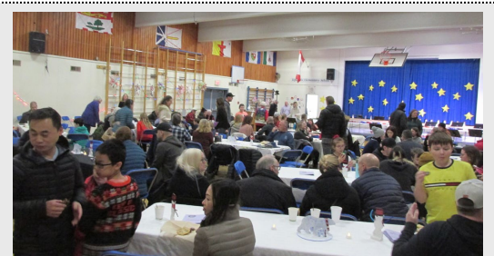
Uplands Elementary School celebrate events that further connect students, their families, and staff to the school by building a positive school climate and culture.

Our Annual Food Drive is a good example of the importance of giving back to the community that we call home. It is an opportunity for our students to understand that families in our community are struggling with food security. Our Christmas Coffeehouses brought students, families, and staff members together to enjoy the musical talents of our students. The weeks of practice leading up to the performances prepared students to perform well in front of an audience of their families. Events such as these further connect our students, their families, and our staff to the school by building a positive school climate and culture at Uplands Elementary School.